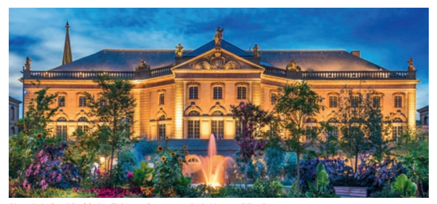
Place de la Comédie / Opéra-Théâtre - Eurometropole de Metz.

Built in the neo-Romanesque style, it sparkles in the River Moselle like a fairytale castle.