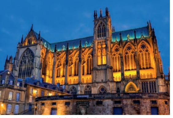
Metz Cathedral.