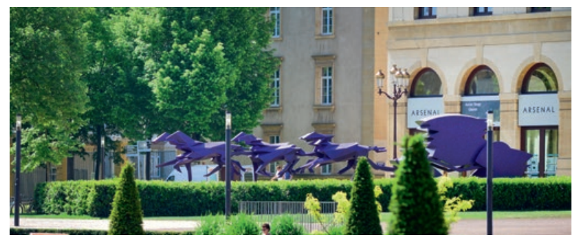
Carrosse de Veilhan.

A French-style garden, emblematic of the city of water and history, overlooking the lake.