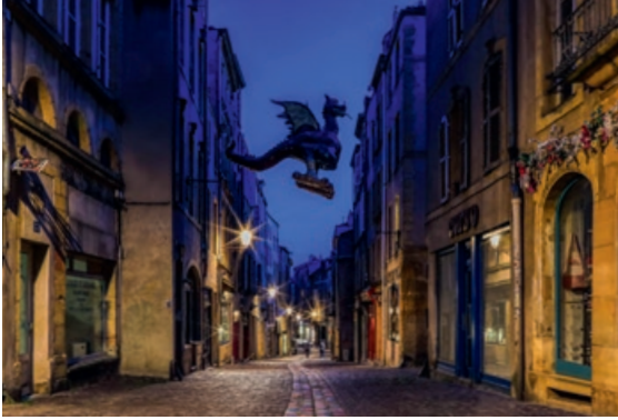
The Graoully - rue Taison.