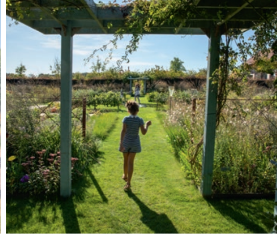
Laquenexy fruit gardens.