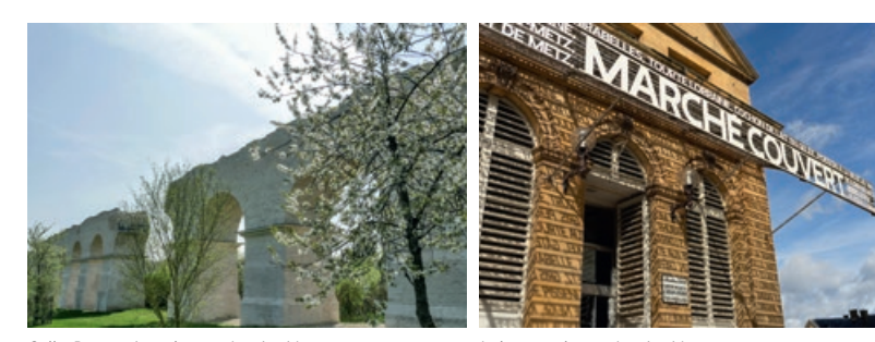
Gallo-Roman Aqueduct.

Flash this QR code to see the complete calendar of events.