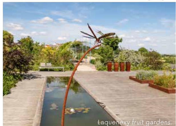
Laquenexy fruit gardens.

Visit the gardens during opening season, discover the gardeners' boutique and our nursery. Off season, you can find us for the traditional sale of fruit plants, and fruit and apple juice.