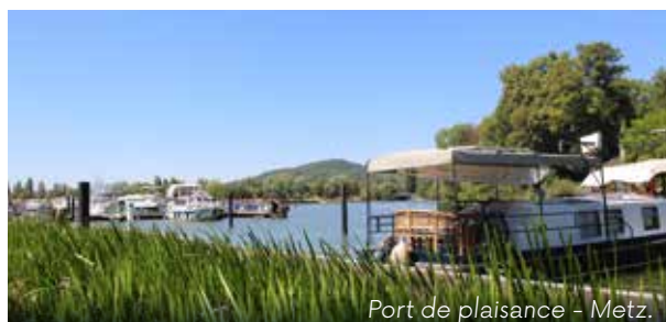
Port de plaisance - Metz.

*Alcohol abuse is bad for your health. Drink responsibly.