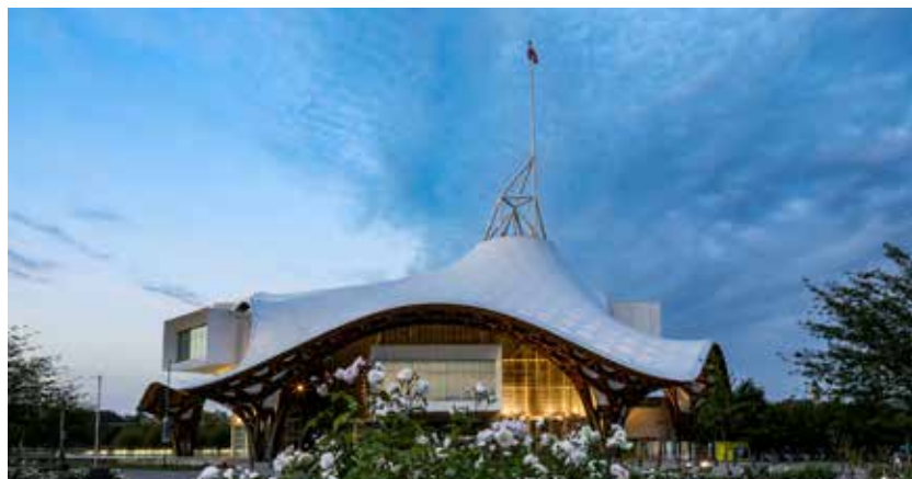
Shigeru Ban Architects Europe et Jean de Gastines Architectes, avec Philip Gumuchdjian pour la conception du projet lauréat du concours / Metz Métropole / Centre Pompidou-Metz / Photo Studio Hussenot.

▼ 2021 Lanterns Walk - Metz Organised by Moselle Department.