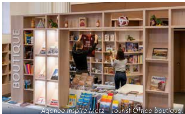
Agence Inspire Metz - Tourist Office boutique.