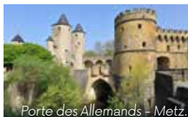
Porte des Allemands - Metz