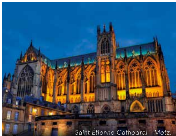
Saint Étienne Cathedral - Metz.