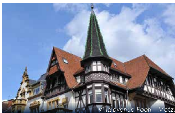
Villa avenue Foch – Metz.