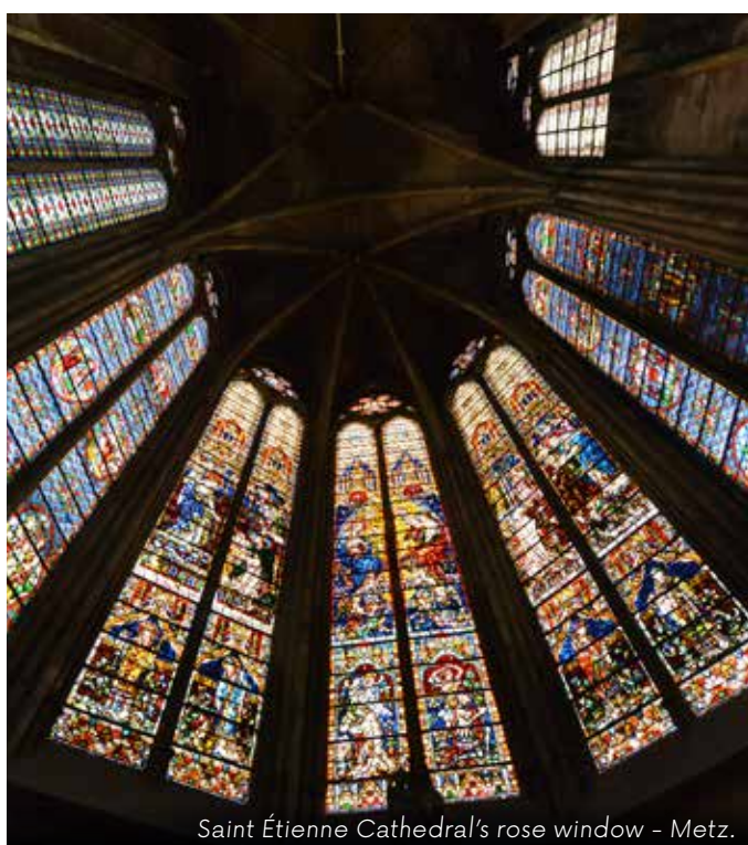
Saint Étienne Cathedral's rose window – Metz.