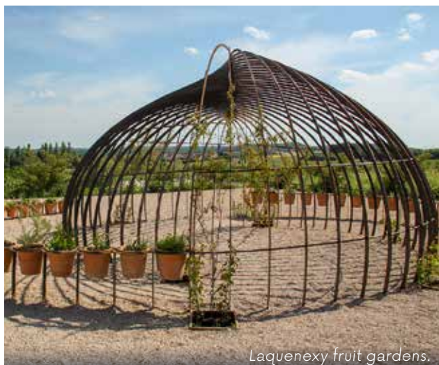
Laquenexy fruit gardens.