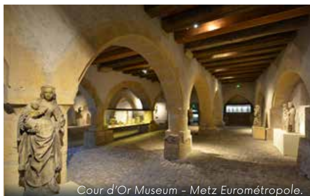
Cour d'Or Museum - Metz Eurométropole.