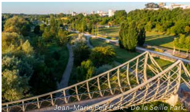
Jean-Marie Pelt Park - De la Seille Park.

► Metz is a garden city! Discover its gardens, all different, with their own identity, history, specific layouts, from the most visible to the most secret... Treasures from nature for the city-dwellers' wellbeing.