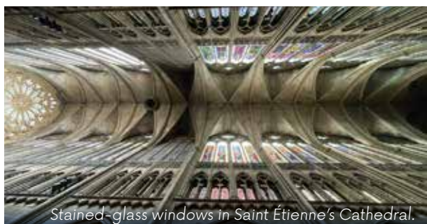
Stained-glass windows in Saint Étienne's Cathedral.