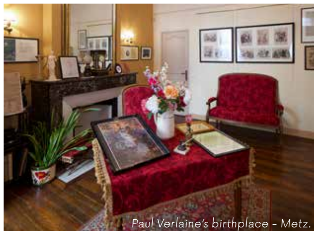
Paul Verlaine's birthplace - Metz.