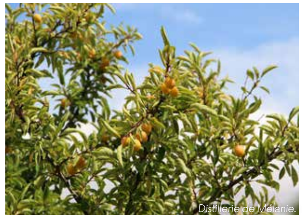
Distillerie de Mélanie.

► Gardens and sites: the Laquenexy Fruit Gardens or Robert Schuman's House and the Garden from round here.