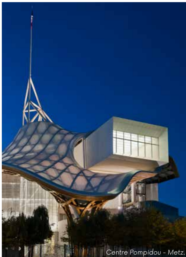
Centre Pompidou - Metz.

YOUR CONTACT Reception Service Phone: +33 (0)3 87 39 01 02 reservation@inspire-metz.com