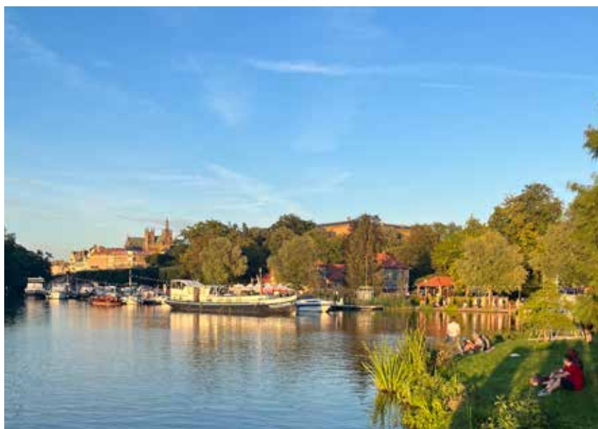
▲ Lake - Metz.

The walks and numerous cycle paths allow you to explore the unspoilt natural sites such as the Mont Saint-Quentin and the picturesque villages nearby.