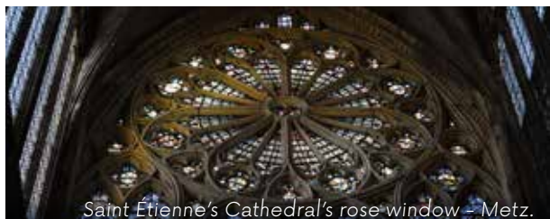
Saint Étienne's Cathedral's rose window – Metz.

► The art of light par excellence , stained-glass windows are present everywhere in Metz's religious buildings. The tour is an opportunity to view stained-glass windows from the medieval period through to contemporary creations, notably the stained-glass windows in Saint Étienne's Cathedral and those designed by Jean Cocteau in Saint Maximin's church.