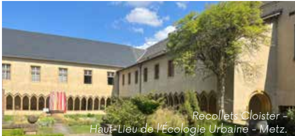
Recollets Cloister - Haut-Lieu de l'Écologie Urbaine - Metz.

► Right in the heart of the town, on Sainte-Croix hill, you will find the Mediterranean-inspired Tanners garden, and the splendid Récollets Cloisters (14th century), which today houses the European Institute of Ecology and the Municipal Archives, as well as a Jardin des Simples (Physic Garden) where you can discover a variety of medicinal plants. The vast Esplanade French formal garden, in the old citadel district, reveals its elegant statuary and harmonious fountains a stone's throw away from the town's shopping streets.