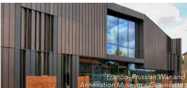
Franco-Prussian War and Annexation Museum – Gravelotte.

Located on the battlefields of the Franco-Prussian war, this is the only museum dedicated to this conflict, its impact on the local area and daily life during the annexation period. 11 rue de Metz 57130 Gravelotte