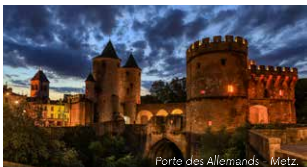
Porte des Allemands - Metz.