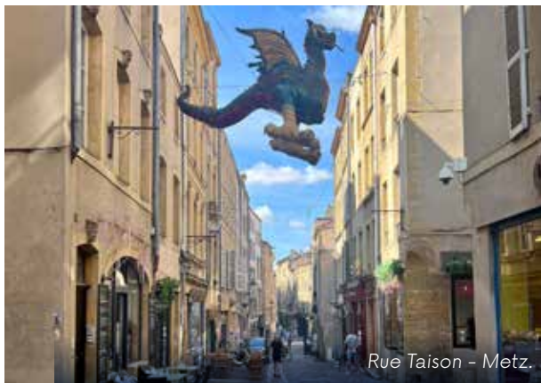
Rue Taison - Metz.