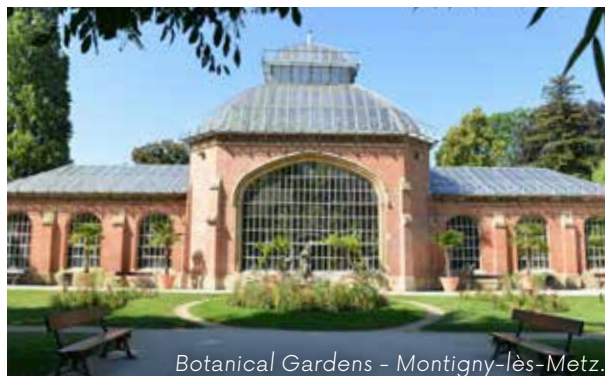
Botanical Gardens - Montigny-lès-Metz.