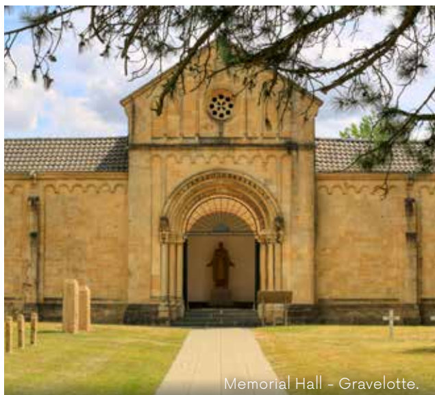
Memorial Hall - Gravelotte.

*Alcohol abuse is bad for your health. Drink responsibly.