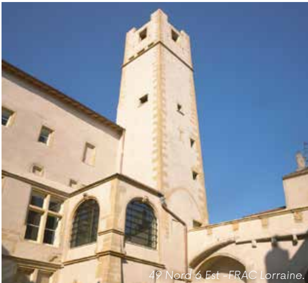
49 Nord 6 Est - FRAC Lorraine.

The 49 Nord 6 Est - Frac Lorraine, is an exhibition space that also stages debates, conferences, film projections, concerts and performances. Its collection of more than 1,600 works pays particular attention to the place given to women in the artistic ecosystem. It is housed in the oldest private mansion in Metz, the Hôtel Saint-Livier, a civil building dating from the 12th century.