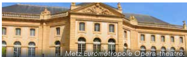
Metz Eurométropole Opera-theatre.