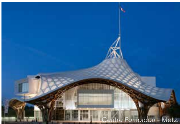
Centre Pompidou - Metz.