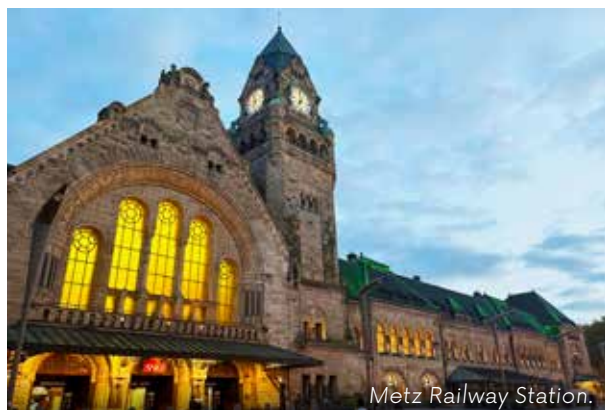
Metz Railway Station.