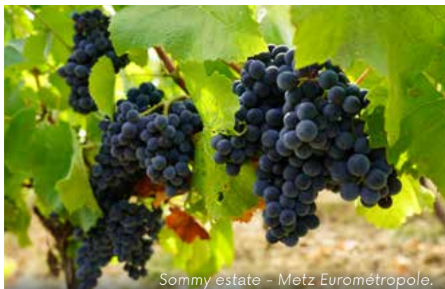
Sommy estate - Metz Eurométropole.