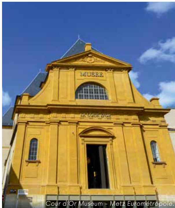
Cour d'Or Museum - Metz Eurométropole.