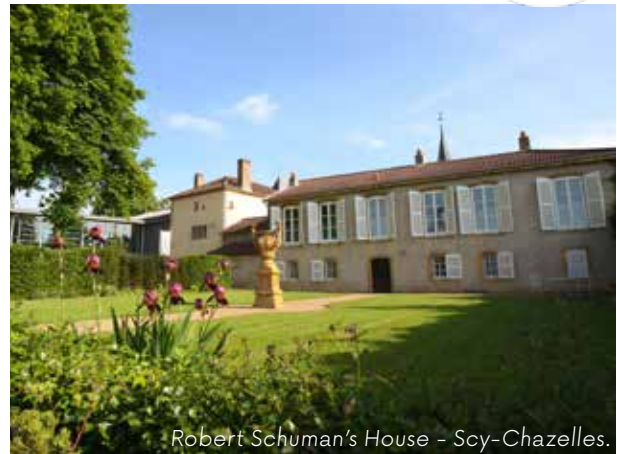
Robert Schuman's House – Scy-Chazelles.

Enter into Robert Schuman's private life by visiting his home, a typical Lorraine 1950s house. Appreciate the architecture of the 12th century Saint-Quentin fortified church opposite, and let yourself be tempted by a stroll among the flowers of the Jardin des Plantes de chez Nous Botanical Garden.