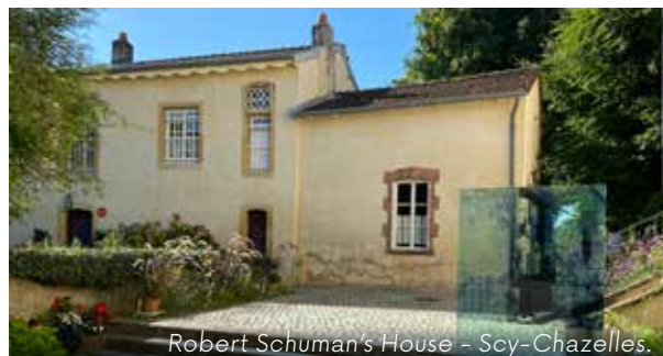
Robert Schuman's House - Scy-Chazelles.