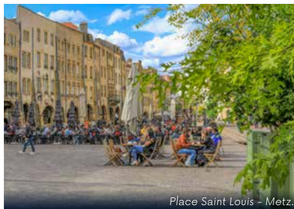
Place Saint Louis – Metz.