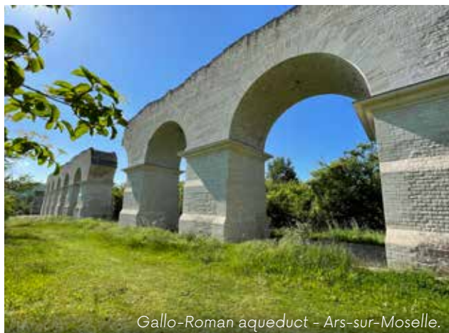
Gallo-Roman aqueduct - Ars-sur-Moselle.