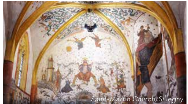
Saint-Martin Church, Sillegny.

► Around Metz, see the hallmarks of a rich and turbulent past: Sillegny church (16th century frescoes), the fortified churches of the Metz Republic and more.