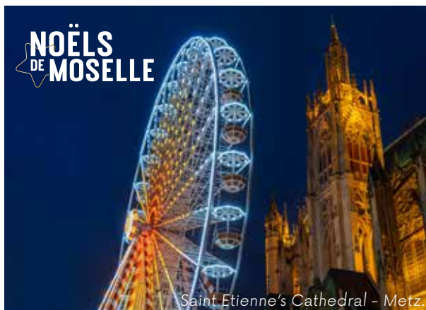
Saint Etienne's Cathedral - Metz.