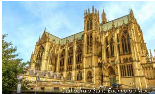
Cathédrale Saint-Étienne de Metz