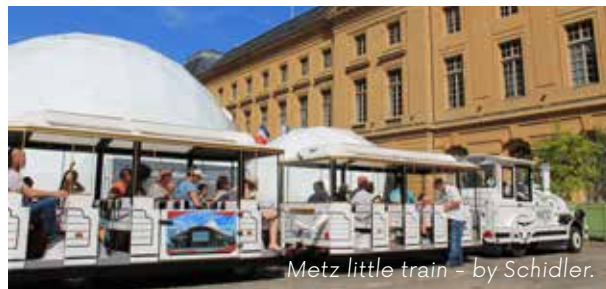
Metz little train – by Schidler.