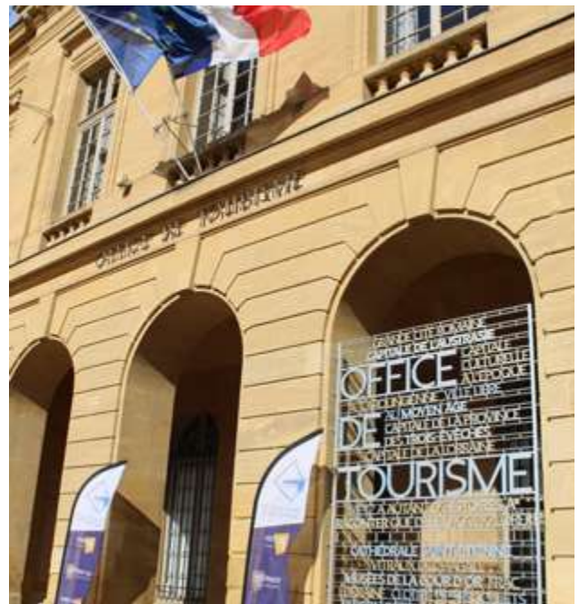
Tourist Office - Agency Inspire Metz

17 641 visitors to Saint Etienne's Cathedral (crypt and treasury) 304 000 visitors to the Centre Pompidou-Metz 14 016 visitors to the FRAC 57 156 visitors to the Cour d'Or Museum (including 33 800 admissions for the Constellations festival). 30 000 visitors to the Porte des Allemands